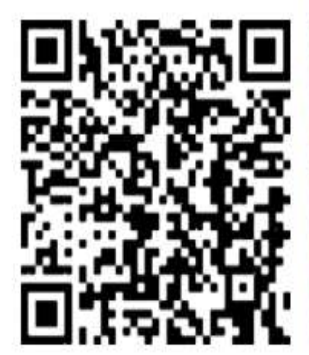
Scan to order! ¡Echa un vistazo para encargar!

Friday, April 05, 2024 \ viernes, 5 de abril, 2024 Bryant Middle School